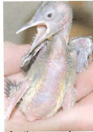
Yellow feathers can be seen on belly of nestling