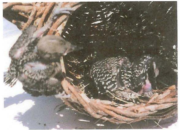
Fledglings have black and white dappled feathers on back and wings

Woodpeckers are cavity nesters; they nest in tree holes and, here in the Southwest, they make homes in cacti. They're also identified by a specific foot design where two toes face forward and the other two toes face backward. The other two birds that have this foot design are the roadrunner and the cuckoo.