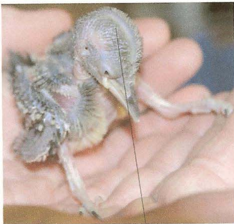
Nestlings have a ridge on the head