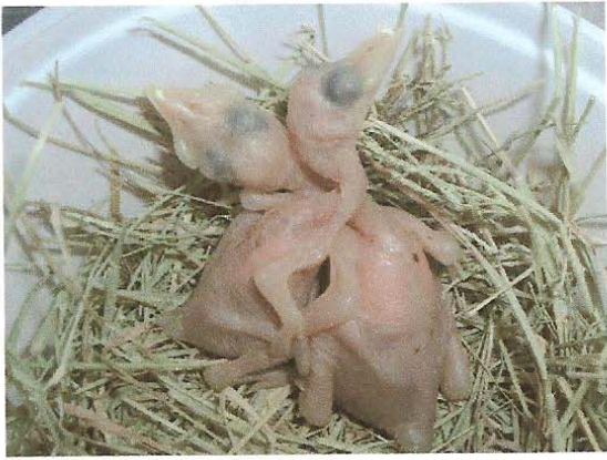
Birds are hatched naked with no down; bill is flesh colored and sturdy looking