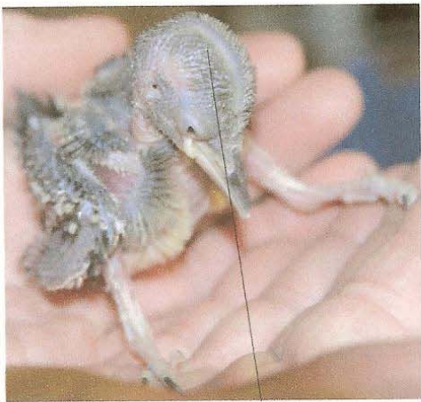
Nestlings have a ridge on the head